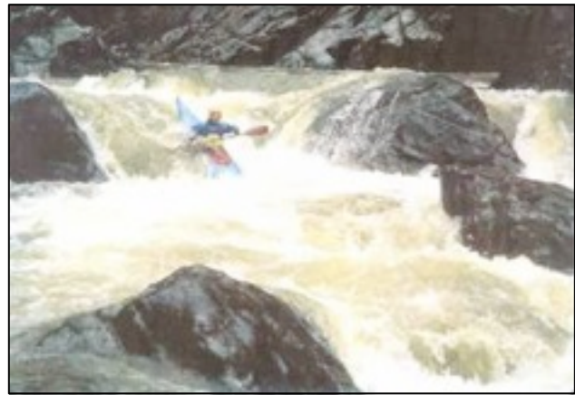
Kayaker running the rapids in the Robe Canyon.

“Gem” of Snohomish County: Now the canyon welcomes hikers and kayakers to its changing beauty. It is still peaceful and lush in the spring, summer, and autumn, but wild in the winter. Those coming down in kayaks are given a wild ride, testing their skills at navigating the rocky channel. It is for experienced kayakers only and is classified as a Class V area of rapids. This is not a peaceful paddle! Hikers enjoy the forest: Marveling at the hemlocks, cedars, Douglas-fir, Sitka spruce and the other evergreens native to these forests. The forest floor is covered with mosses, ferns, and flowers in the summer. In the sandy soil near the river, there is an abundance of the tiny pink, native roses. Birds thrive in the brush and trees, and you will often see kingfishers and eagles near the river. In the autumn, you will see salmon returning to their first homes upstream. It is a place to enjoy peace today and imagine the lively past.